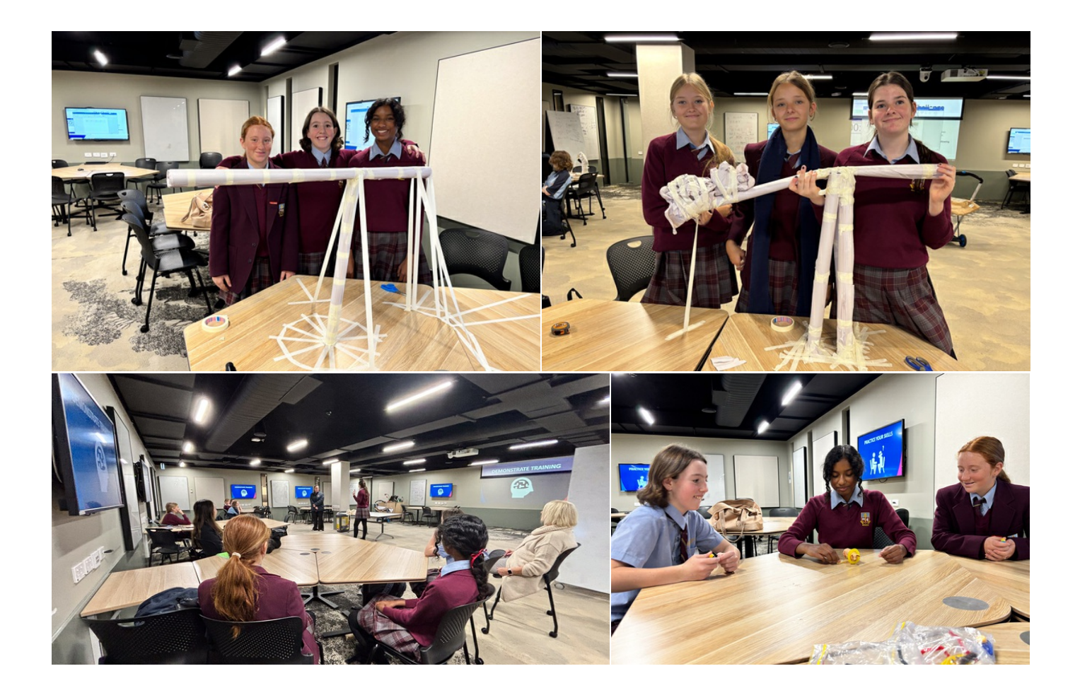
Pathways Expo - Employment and Group Training Organisations