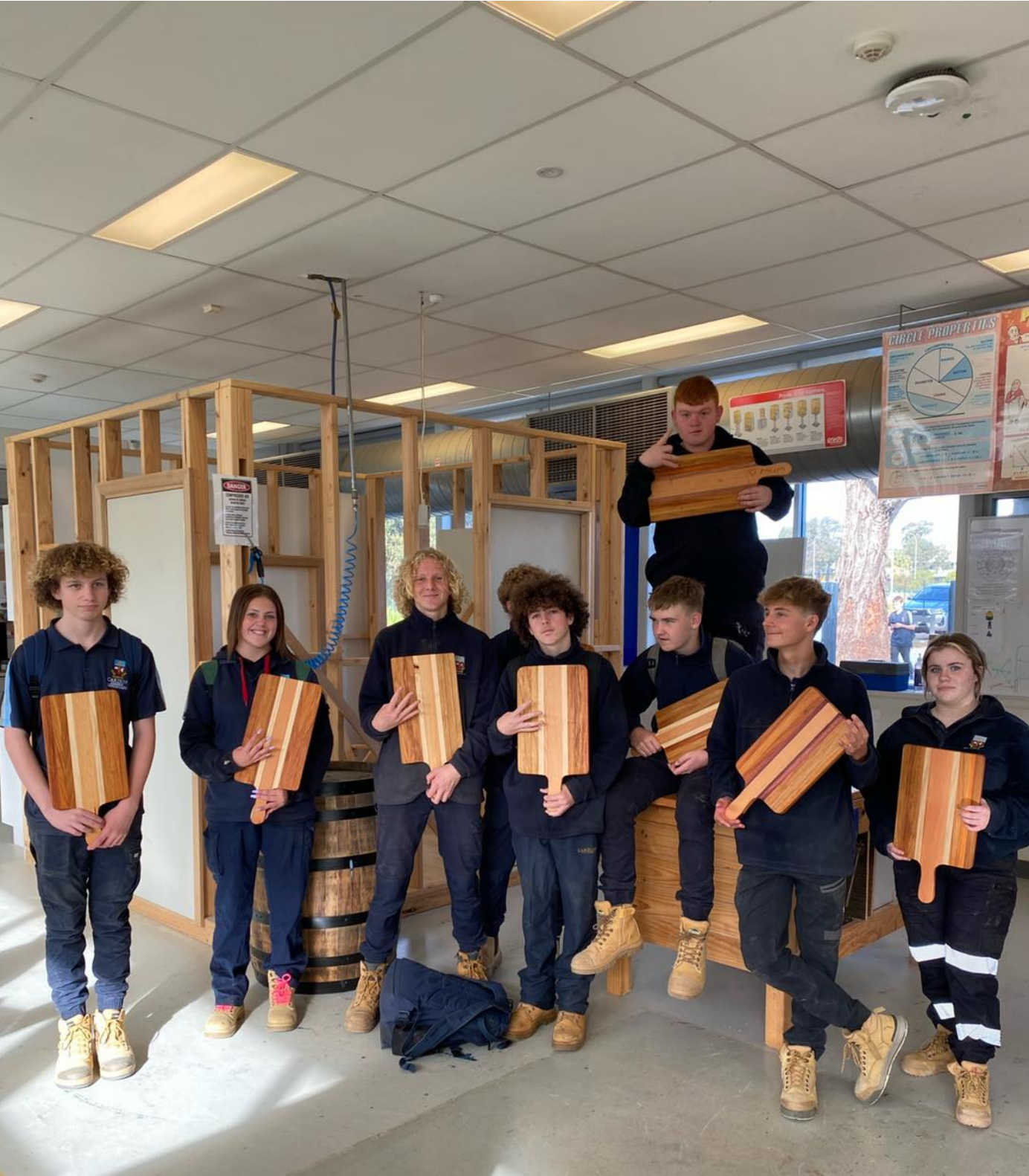
Year 10 students perfected their woodwork skills by creating these handmade chopping boards as gifts for Mother's Day